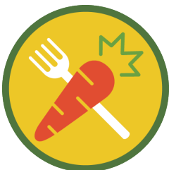
Seed to Plate