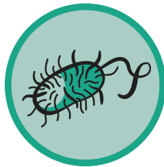
Food Safety & Sanitation