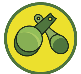
Kitchen Math + Measurement