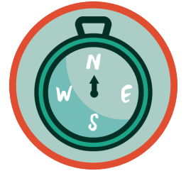
Leadership & Organization