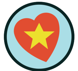
Caregiving & Wellness