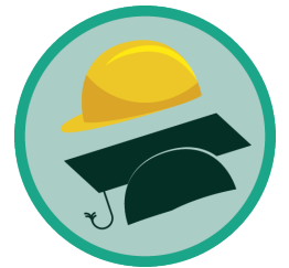
Careers in FCS